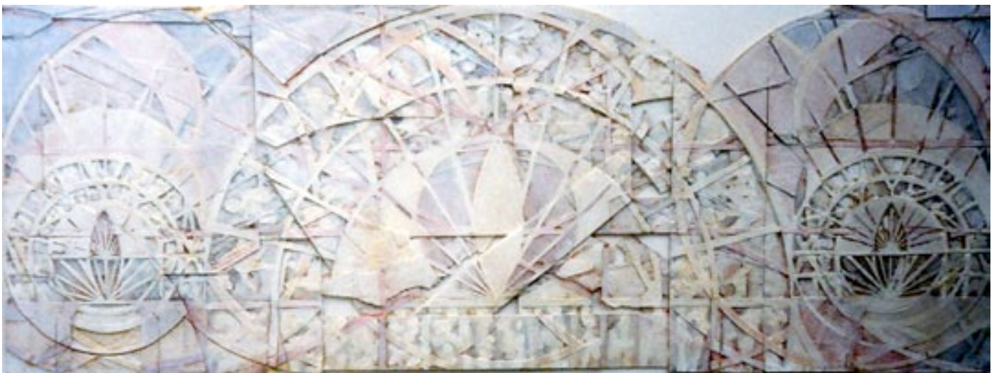
“Study for Network 90”.1989. Painted and cut-out collage. 30x79cm. Collection of the artist.