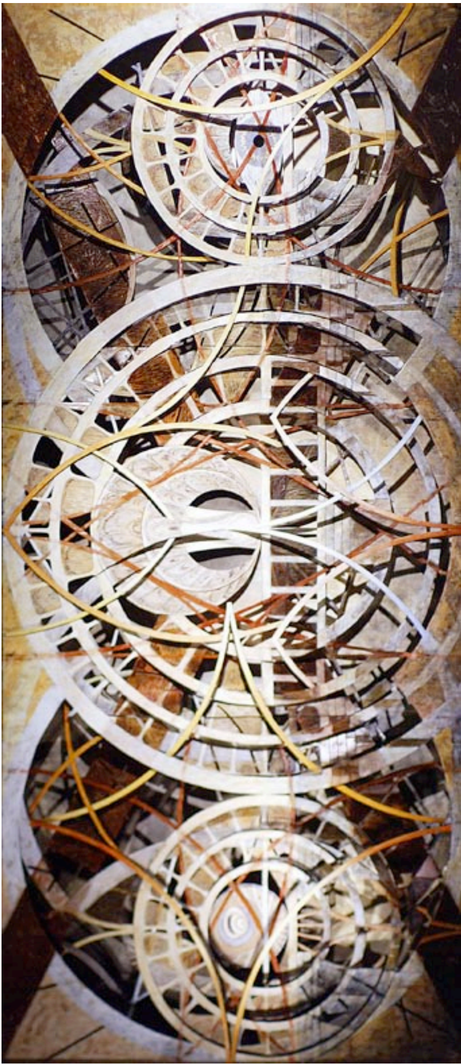
“Network 90” . Oil on carved and constructed plywood.1889/1990. 500x200x30cm.