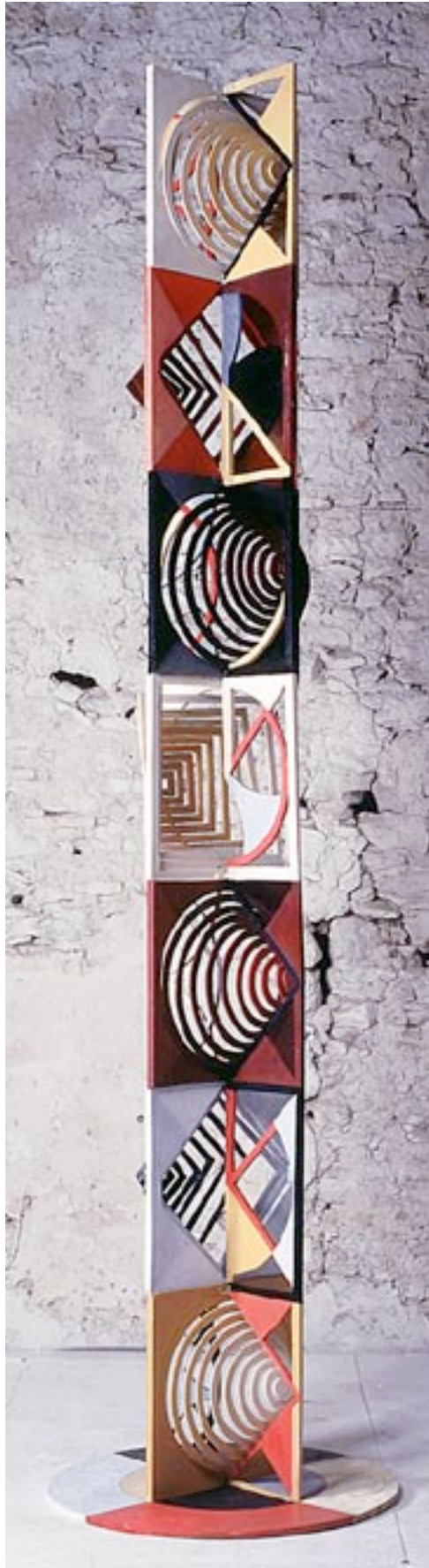
Jacob's Ladder 1. 2000. 308x44x44cm. Painted and constructed wood. Matrix available to cast into bronze.