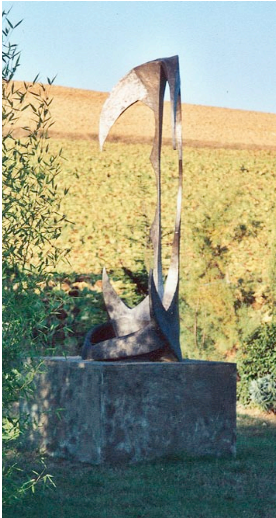
Bronze. Edition of three. 226x90x77cm. Approximate weight 200kg. N°1. Private Collection. N°2. Available. N°3. Available for casting.