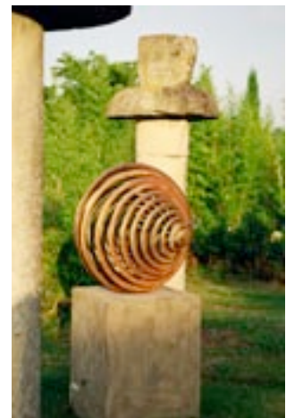
Light Dominates. 2002. 77x77x77cm. Weight. 64 kgs.