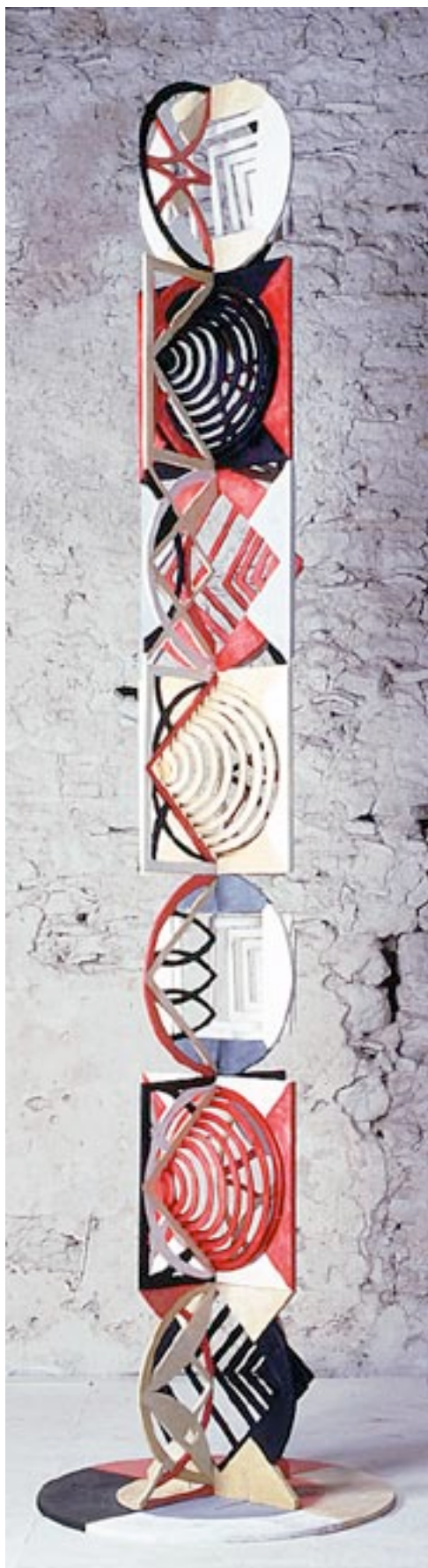
Jacob's Ladder 1. 2000. 308x44x44cm. Painted and constructed wood. Matrix available to cast into bronze.