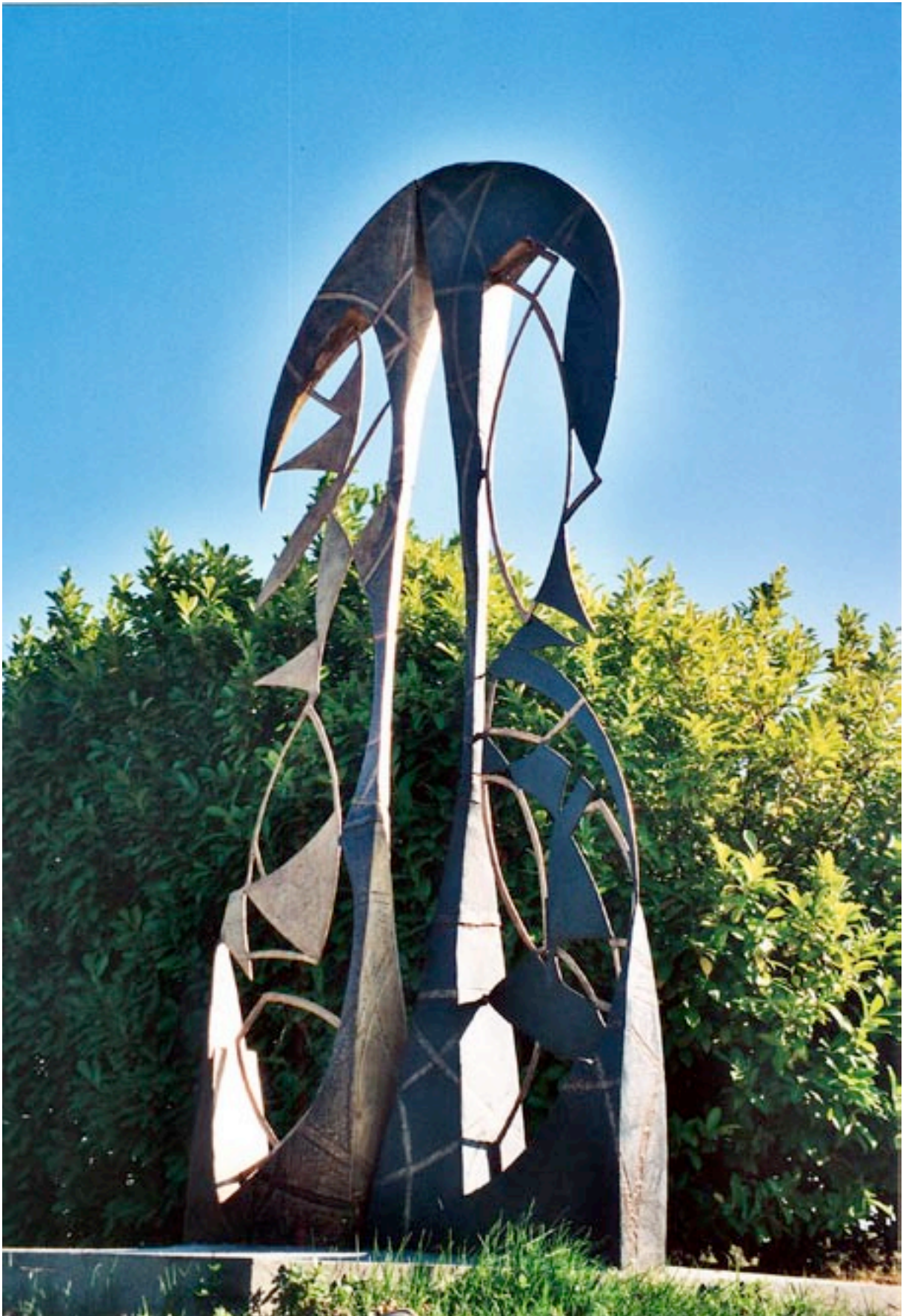
Part 1 "The Baladeur" or "The Stroller" or "The Wanderer" Bronze.2000. 310x150x50cm. Weight in bronze approx. 800kg.

A sculpture in two parts, each piece with two elements.