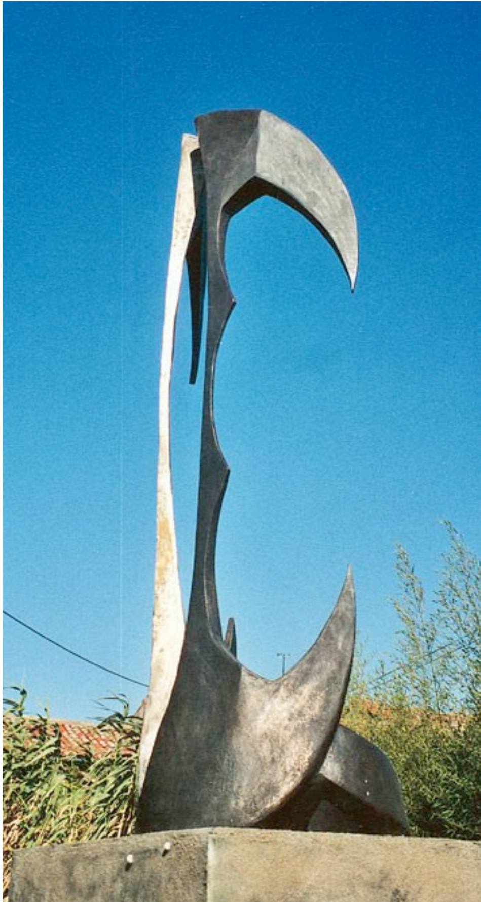
Standing Room can be viewed at the artist's home in South West France.