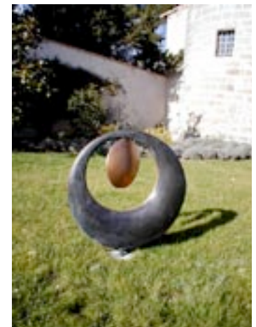
Dawn. Bronze. 2004. 60x60x10cm Private Commission