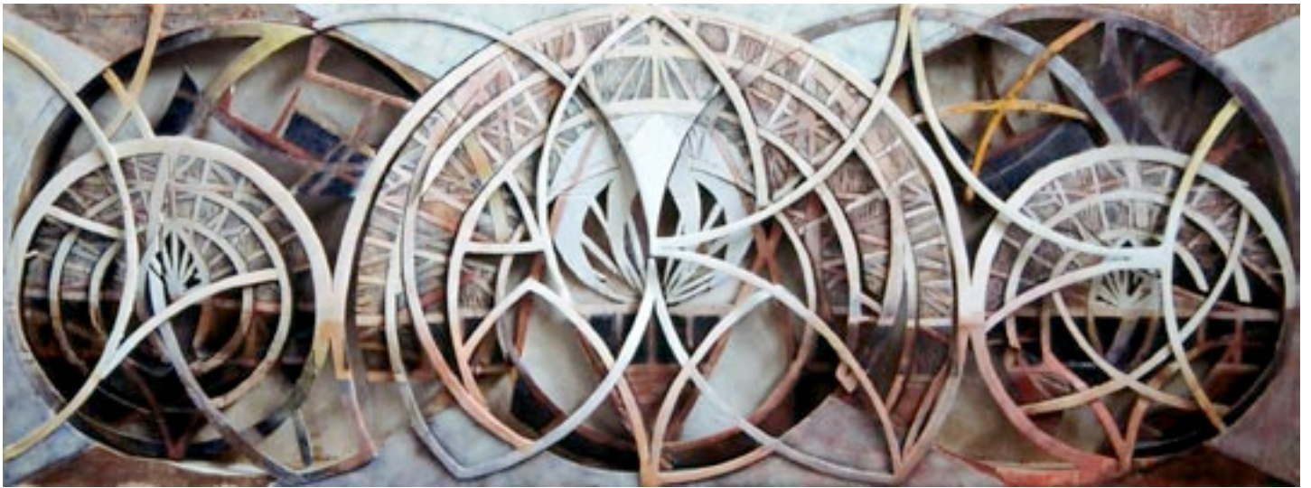
“Maquette for Network 90”. 1989. Oil on carved and constructed plywood. 42x122x6cm. Collection of the Artist.