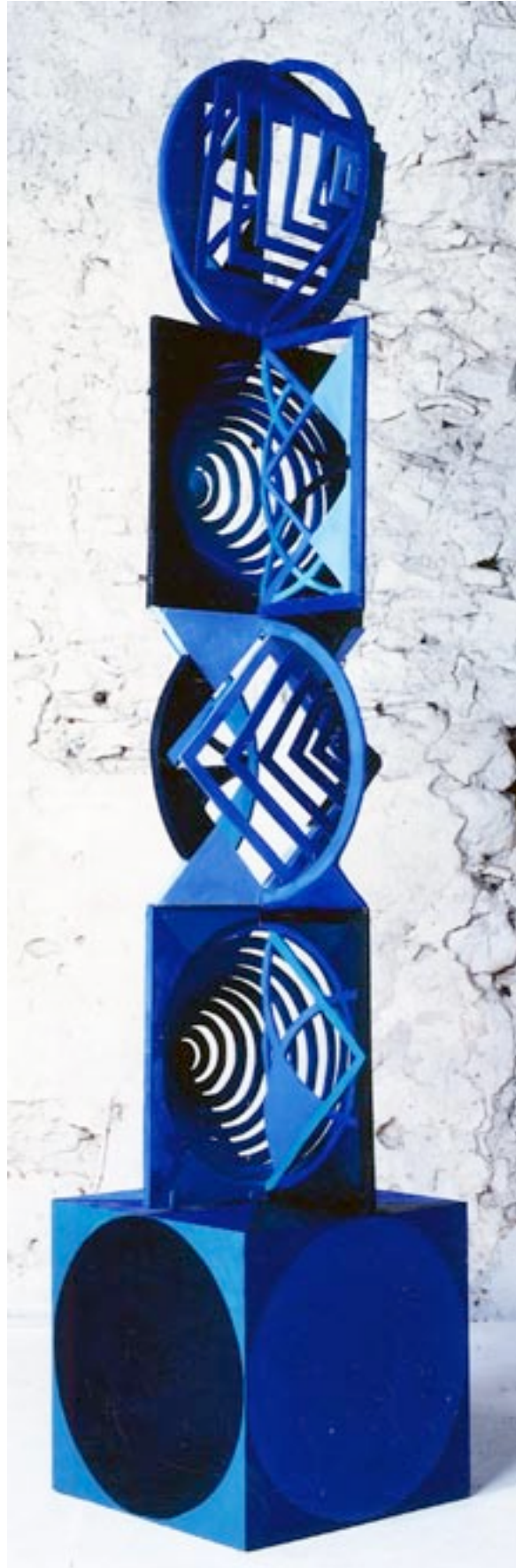
Small Jacob's Ladder. 2000. 220x44x44cm. Painted and constructed wood. Matrix available to cast into bronze.