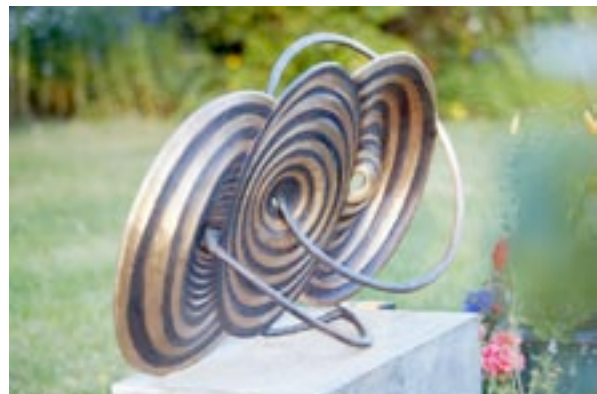
Memory of San Galgano. 2002. Bronze. 122x60x40cm. Weight. 80 kgs.