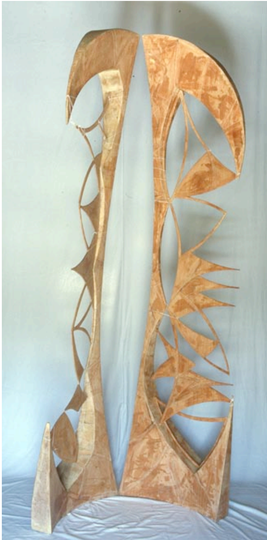
Part 2. «Le Protecteur», «The Protector » or «The Shield». 310x120x70cm. Matrix available to cast into bronze.