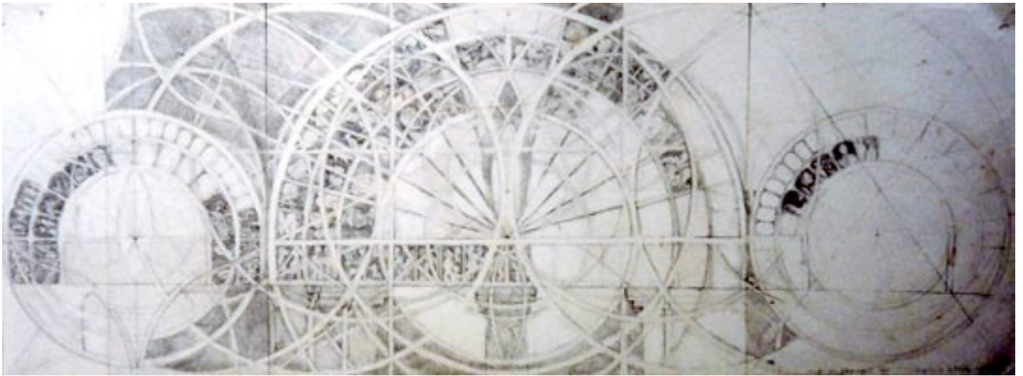
“Study for Network 90”.1989. Pencil. 32x85cm. Collection of the artist.